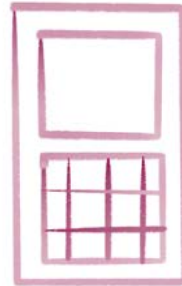
icons for bus. card